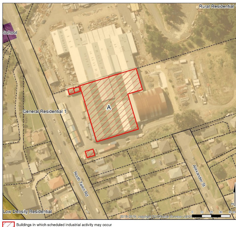
Figure 15.8.ALA: Former brickworks structure plan